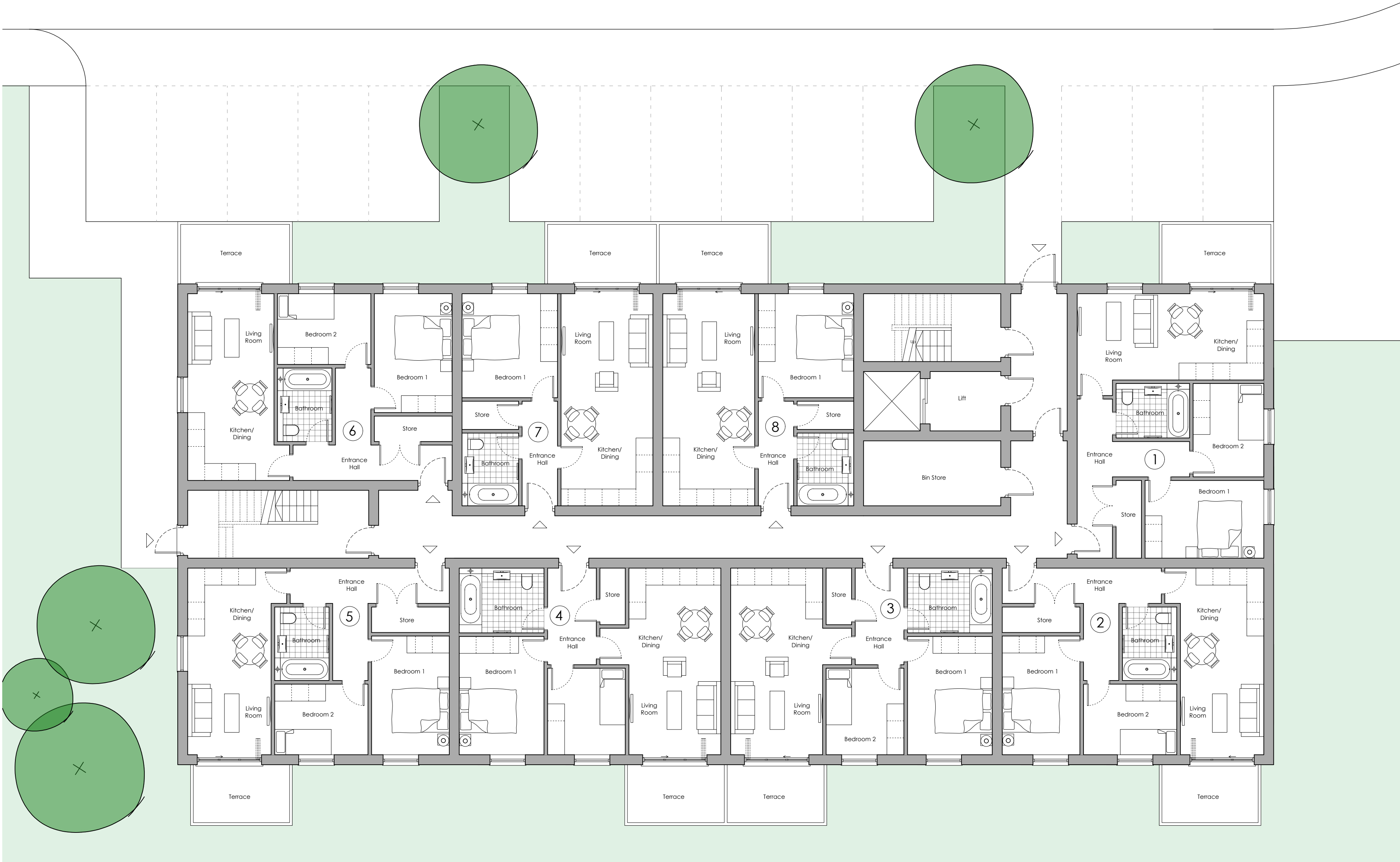
Proposed Ground Floor Plan 1:100 @ A2